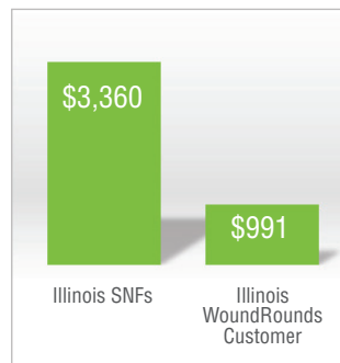
2016 Loss Rate Comparison

* AON 2017 Long Term Care General Liability and Professional Liability Actuarial Analysis